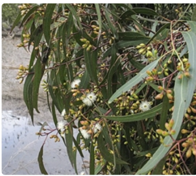
Flowers, buds, and leaves.