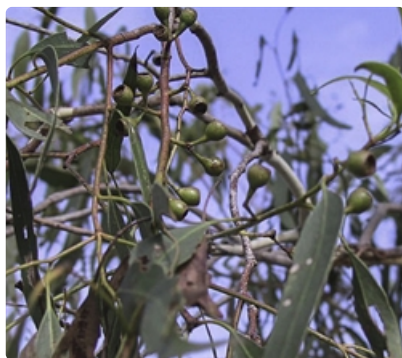
Leaves and gumnuts.