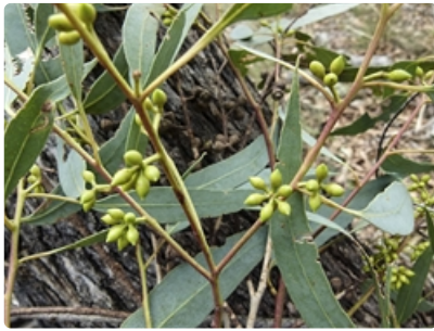
Flower buds and leaves. between Bungendore and Braidwood