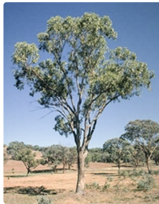
Tree. Australian Plant Image Index, photographers Brooker & Kleinig, unknown place