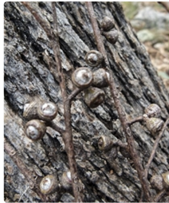
Gumnuts on bark. between Bungendore and Braidwood