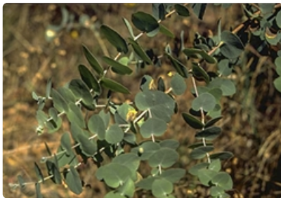
Juvenile leaves on stems. Aranda, Canberra, ACT