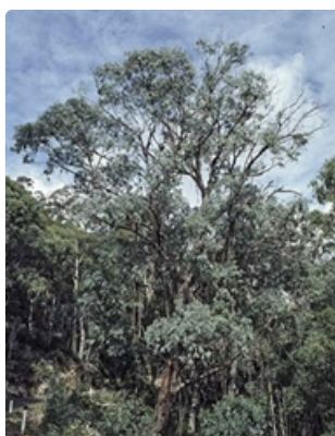
Trees. Mt Buffalo, Vic