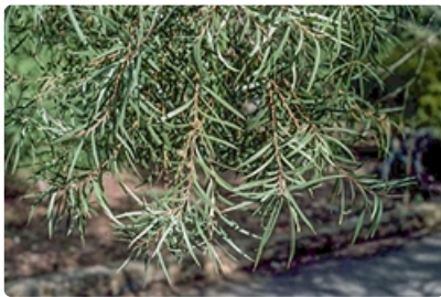
Leafy stems.