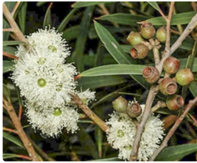
Flowers, gumnuts, and leaves.