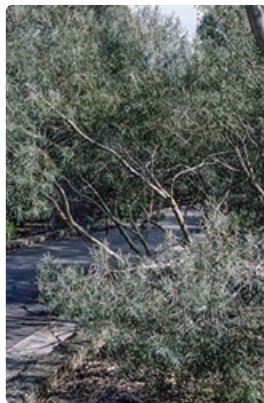
Mallee.