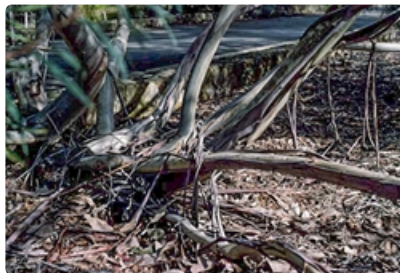
Trunks.