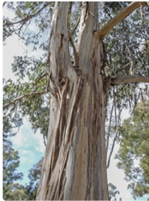
Trunk. Australian Plant Image Index, photographer Murray Fagg, Australian National Botanic Gardens, Canberra, ACT