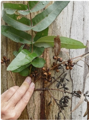
Juvenile leaves, flower buds, and gumnuts on trunk.