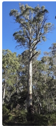
Tree. east of Tumut