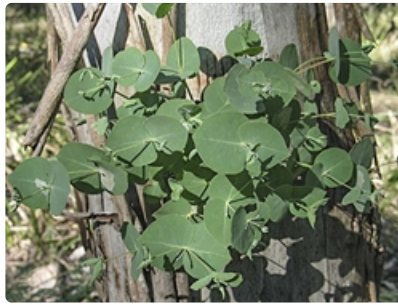
Juvenile foliage.