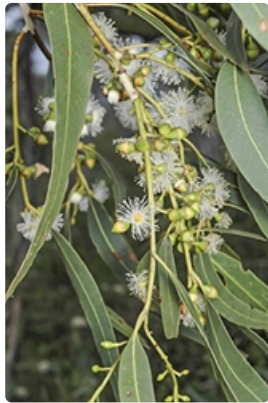
Flowers, buds, and leaves (subsp. dalrympleana ). Namagi National Park, ACT