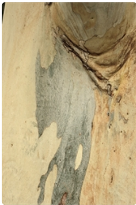
Bark. Photographer Malcolm Storey, Kew Gardens, England