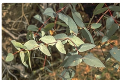
Juvenile leaves.