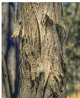
Trunk. Australian Plant Image Index, photographer Peter Orray, Canberra, ACT