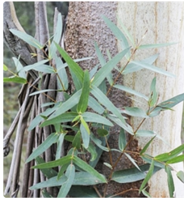
Juvenile leaves and trunk. Jackie Miles