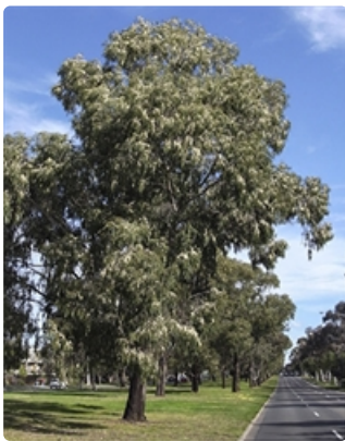
Street tree.