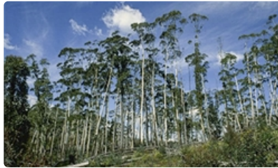
Trees. Brown Mountain west of Bega