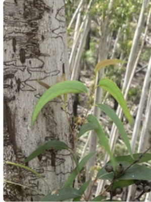
Bark and leaves.