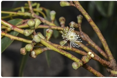
Flower and buds. Tinderry Range east of the ACT