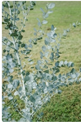
Juvenile leaves. unknown place