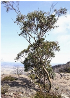
Mallee. Australian Plant Image Index, photographer Murray Fagg, Tinderry Range east of the ACT