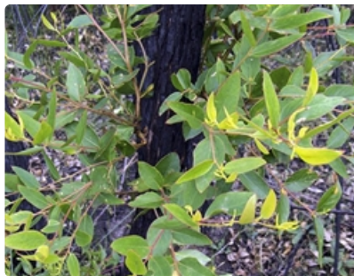
Coppice (juvenile) growth. Kuringai Chase National Park, Sydney