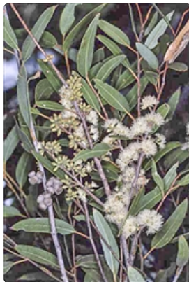
Flowers, buds, and leaves.