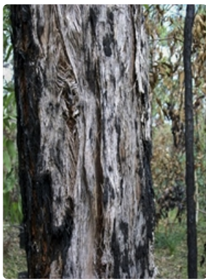
Trunk. Kuringai Chase National Park, Sydney