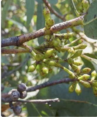
Flower buds.