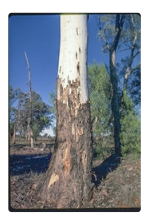
Trunk NW of Nyngan