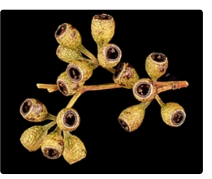
Gumuts on stem Australian Flant Image Index, photographers Brooker & Kleinig, unknown place