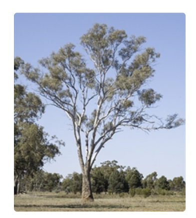
Tree. Yathong Nature Reserve W of Mount Hope