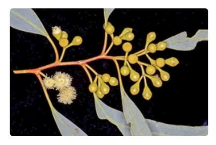
Branch with buds and flowers. E of Warburton WA