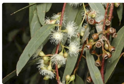
Flowers, buds, gumnuts, and leaves. Australian Plant Image Index, photographer Murray Fagg, Narranderra to Wagga