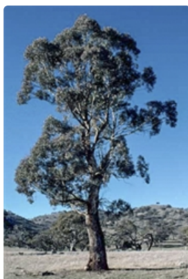
Tree. Australian Plant Image Index, photographer Murray Fagg, near Tharwa, ACT