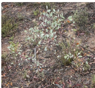
Juvenile regrowth. Black Mountain, Canberra, ACT