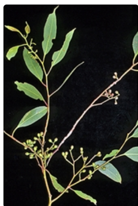
Leaves and gumnuts. Photographer Don Wood, Carnarvon Station Bush Heritage Reserve via Augathella, Qld