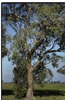
Tree. Australian Plant Image Index, photographer Denise Grieg, Deniliquin