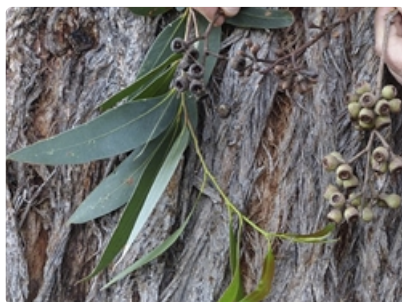
Bark and gumnuts.