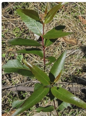
Juvenile foliage.