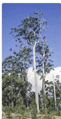
Tree. Australian Plant Image Index, photographers Brooker & Kleinig, unknown place