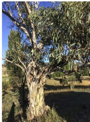
Tree (subsp. pauciflora ) Burra south of Queanbeyan