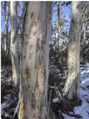
Bark. Australian Plant Image Index, photographer Murray Fagg, Narradgi National Park