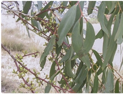
Flower buds and leaves.