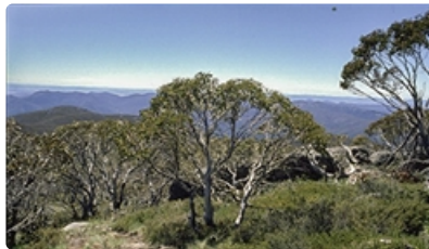
Trees (subsp. debeuzevillei ) M Gingera, Narradgi National Park, ACT