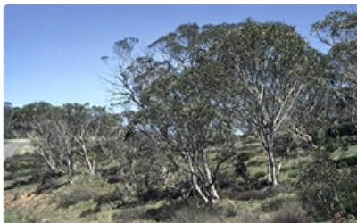
Trees (subsp. niphophila ). Kosciuszko National Park