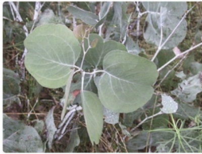
Seedling (subsp. vestita ).