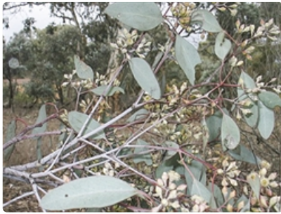
Flower buds and leaves (subsp. polyanthemos ).