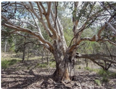
Tree. Mudjarr Nature Reserve near Tumut