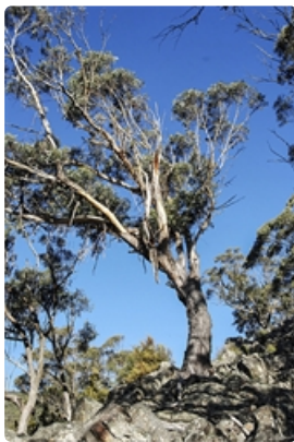
Tree. Jenolan Caves