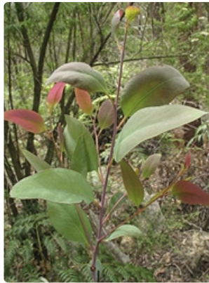
Juvenile foliage.