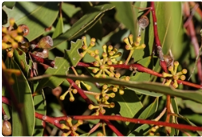
Flower buds. Royal National Park south of Sydney