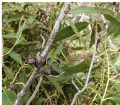
Gumnuts and leaves. between Bungendore and Braidwood