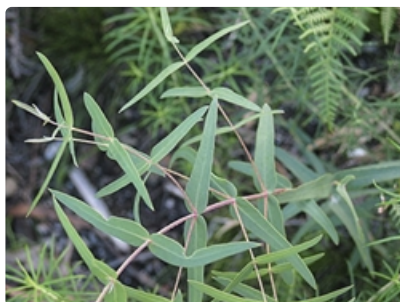
Juvenile foliage.