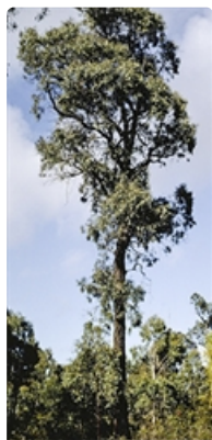
Tree. Australian Plant Image Index, photographer Denise Grieg, near Maryborough, Vic