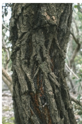
Trunk. Werribee Gorge State Park west of Bacchus Marsh