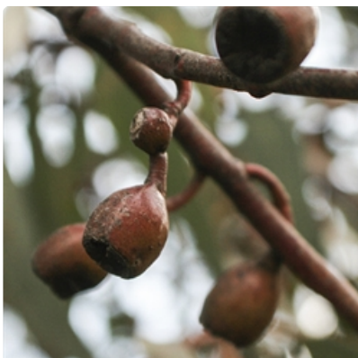
Gumnuts. Werribee Gorge State Park west of Bacchus Marsh