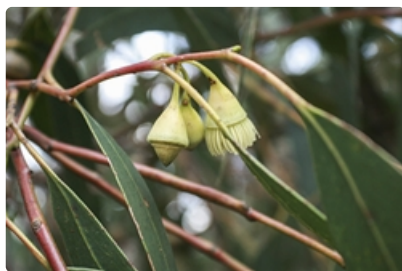
Buds and leaves. Werribee Gorge State Park west of Bacchus Marsh