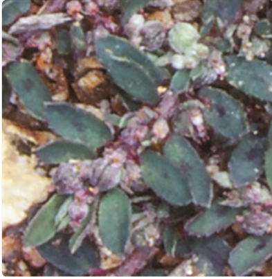
Flowers, seed cases, and leaves. Eurobodalla Regional Botanic Gardens north of Moruya