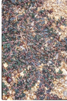
Plant. Photographer Don Wood, Eurobodalla Regional Botanic Gardens north of Moruya