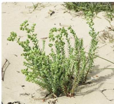
Plant. Apollo Bay, Vic.