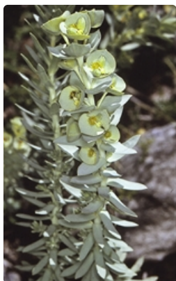
Seedling plant. Eurobodalla National Park south of Narooma