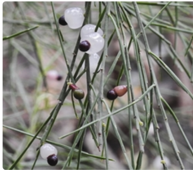
Stems and immature and mature fruit. Namadgi National Park, ACT