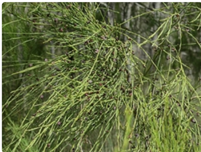
Fruiting stems.