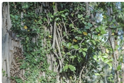
Climber. The Entrance, Vic