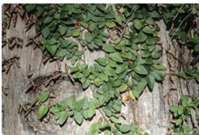
Climber. Australian Plant Image Index, photographer Murray Fagg, The Entrance, Vic