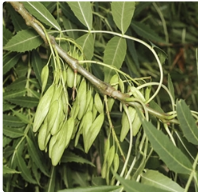
Young 'seeds'. Jerrabomberra Wetlands, ACT