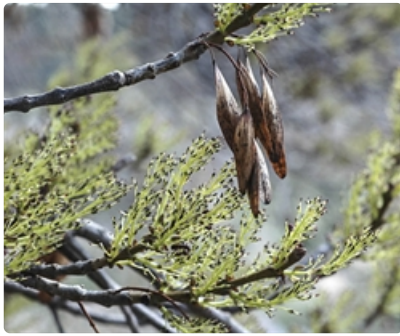
Flowers and mature 'seeds'. Australian Plant Image Index, photographer Murray Fagg, Jerrabomberra Wetlands, ACT