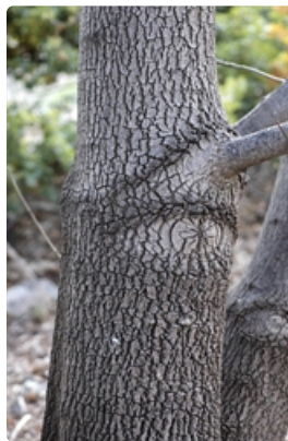
Trunk. Jerrabomberra Wetlands, ACT