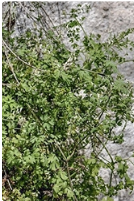
Plant. Photographer JC Schou, Greece