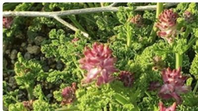
Flowers and leaves. Photographer עומר וינר Israel