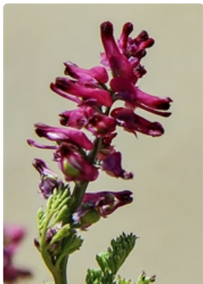
Flower cluster.