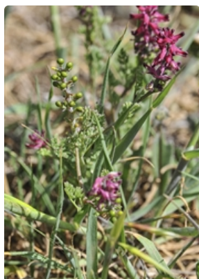
Plant.