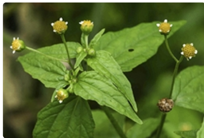
Flower heads and leaves. Photographer Bart Wursten, Zimbabwe