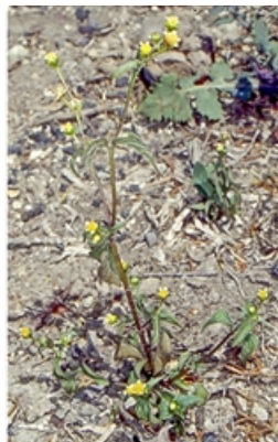
Flowering plant. west of Parramula