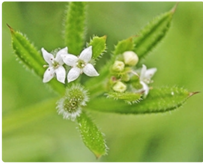
Flowering stems.