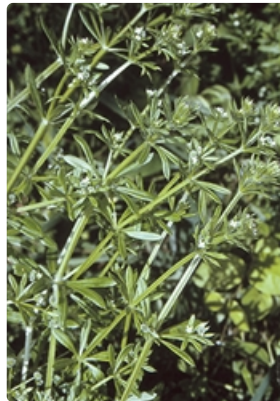
Flowering stems. west of Bodalla