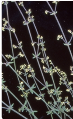
Flowering stems. Namadgi National Park, ACT