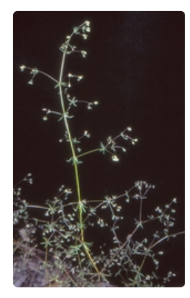
Flow ering plant. Photographer Don Wood, Black Mountain, Canberra, ACT