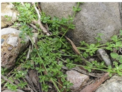
Flowering plant.