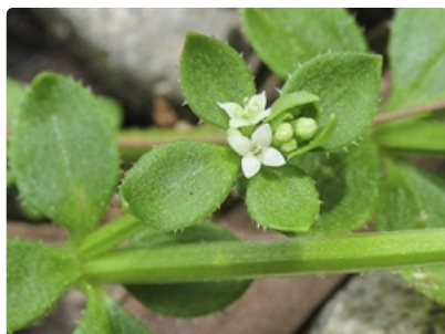
Flowering stem.