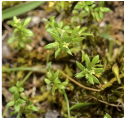
Flowering stems. Black Mountain, Canberra, ACT