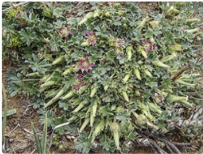
Flowering and seeding plant.