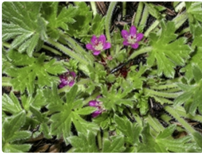
Flowering plant.