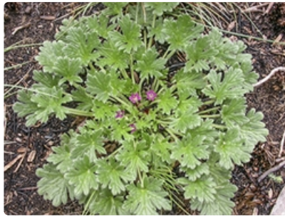
Flowering plant.