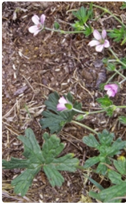
Flowers and leaves. Namadgi National Park, ACT