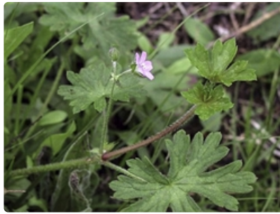
Flower and leafy stems.