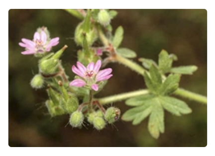
Rowers, spent flowers, and leaves. Scottsdale Bush Heritage Reserve near Bredbo