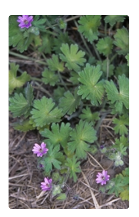
Flow ering plant. Murrumbidgee River, ACT