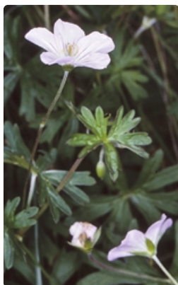
Flowers and leaves. River Forest Road near Monga south of Braidwood