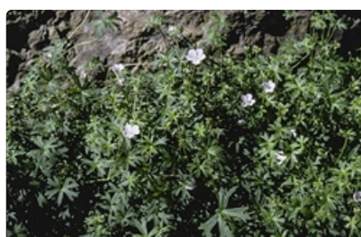
Flowering plant.