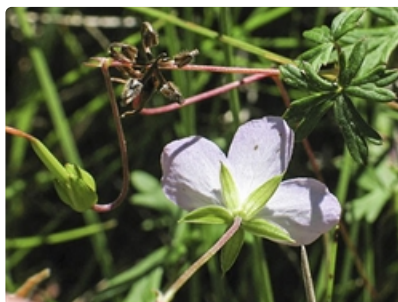
Back of flower, seed case and leaf.