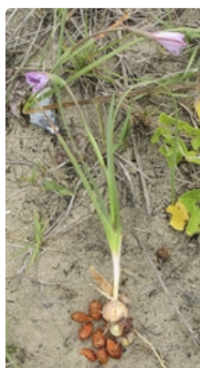
Plant. beach, NSW