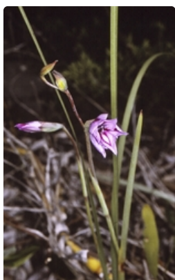
Flowering plant. Jervis Bay National Park, NSW