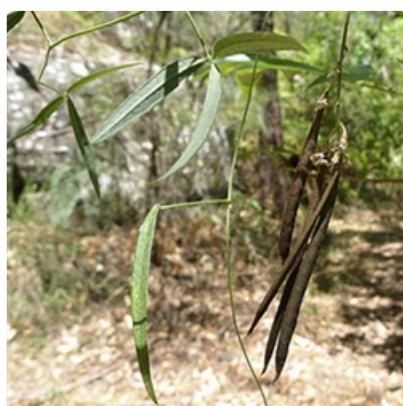
Pods and leaves.