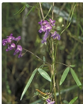
Flowers and leaves. Ben Boyd National Park south of Eden