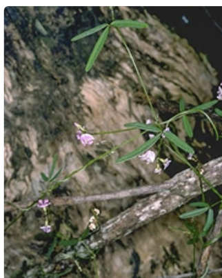
Flowers and leaves. Australian Plant Image Index, photographer Murray Fagg, North Durras