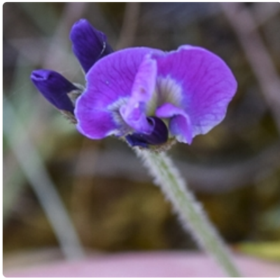
Flower and buds. Grampians National Park, Vic