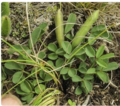
Pods and leaves. Kosciuszko National Park