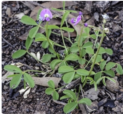
Flowering plant, south of St Arnaud, Vic