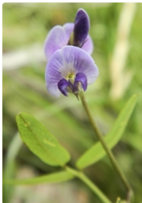
Flowers. Jerrabomberra Grassland Reserve near Queanbeyan