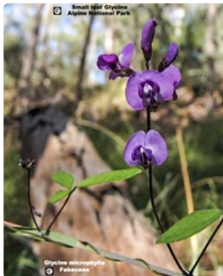
Flowers and leaves. Alpine National Park, Vic