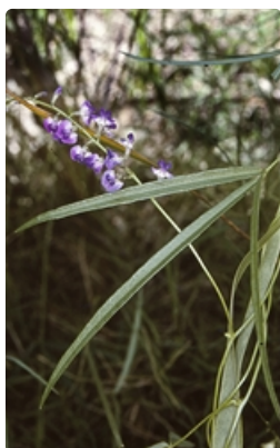
Flowers and leaf. Conjola State Forest