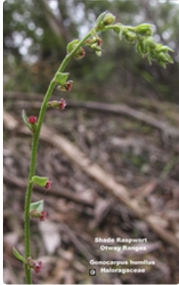
Flowering stem. Photographer Richard Hartland, Otway Ranges, Vic