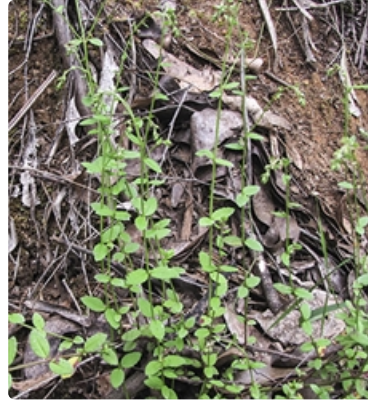
Plants. Otway Ranges, Vic