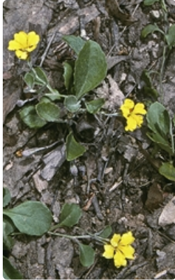
Flowering plants (subsp. hederacea ). between Araluen and Mbruya