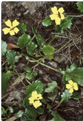
Flowering stems (subsp. alpestris ). Photographer Don Wood, Deua National Park