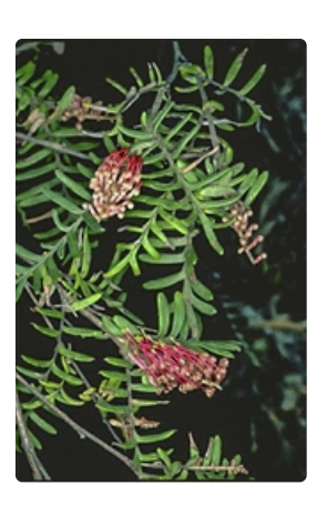
Flowering branches.