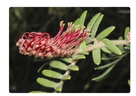
Flower cluster and leaves.