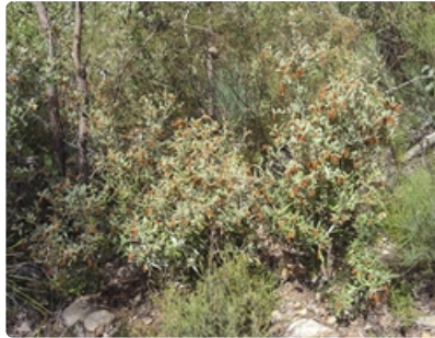
Shrub. Goobang National Park, near Parkes.