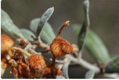
Flowers and leaves. Mandagery State Forest, NSW