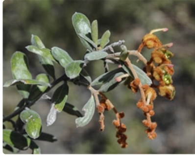
Leafy stem with flower buds. Mandagery State Forest, NSW