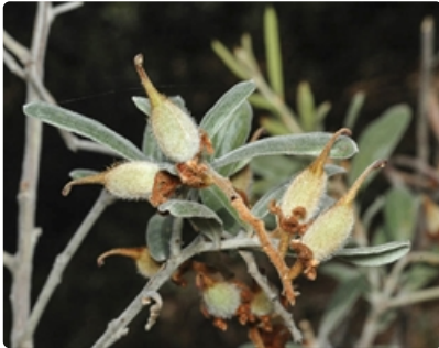
Leafy stems with young seed cases.