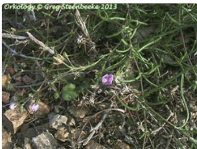
Flowering plant. Photographer Greg Steenbeeke, Mree, NSW