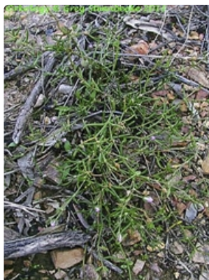
Flowering plant. Photographer Greg Steenbeeke, Mree, NSW