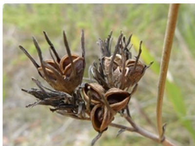
Open seed cases. Royal National Park, Sydney