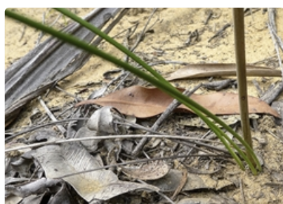
Leaves and flower stalk. Royal National Park, Sydney