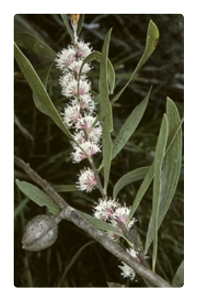
Flow ering stem with 'nut'. Photographer Don Wood, Morton National Park