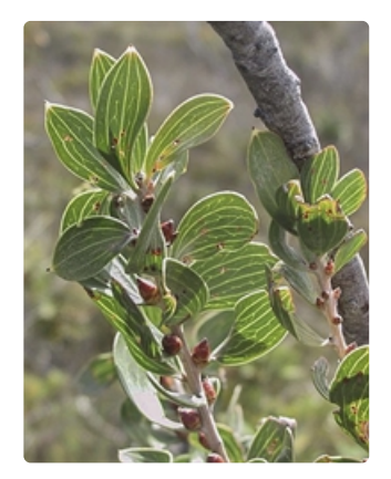
Leaves and flow er buds.