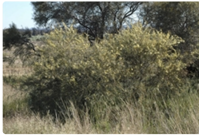
Shrub. east of Rankin Springs, NSW