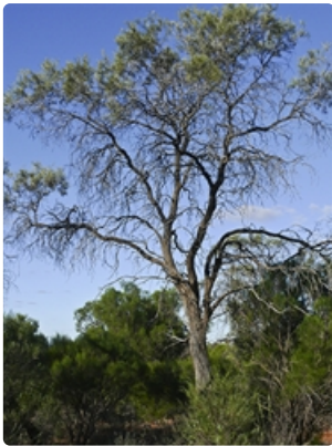
Tree. Scotia Sanctuary, western NSW