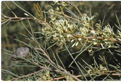
Flowers and 'nut'. Australian Plant Image Index, Photographer Murray Fagg, east of Rankin Springs, NSW